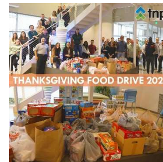
TNP held a massive Thanksgiving canned food drive to benefit Community Food Bank!