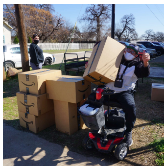
Amazon mystery boxes are always a client favorite.