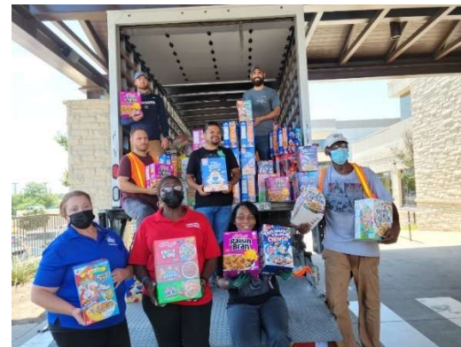
Medical City Fort Worth Hospital cereal drive is essential for feeding kids during the summer months.