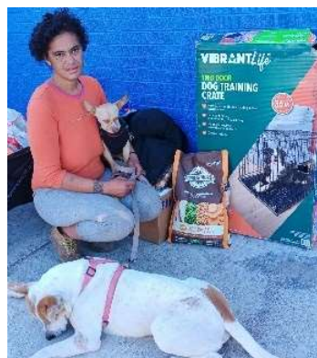
Client starting a new job receives dog kennel to house her best friend.