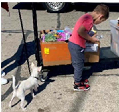
Child and his best friend checking out the Food Box goodies.