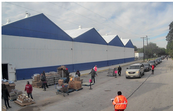
Clients preregister for Thanksgiving Time and schedule a pickup time for a smooth distribution.