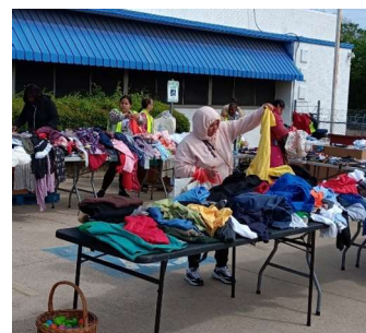
Lots and lots of clothes given at Community Food Bank!