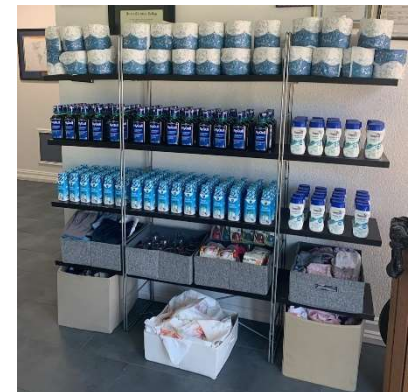
The Front Office shelf's most popular item is always toilet tissue.