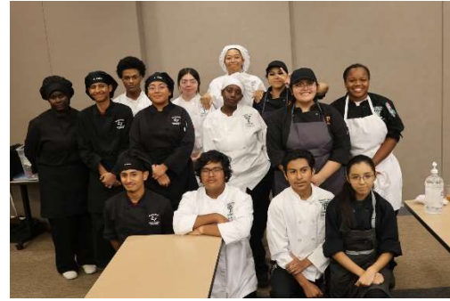
FWISD Culinary Art students highlight our Annual FW Iron Chef Competition Fund Raiser.