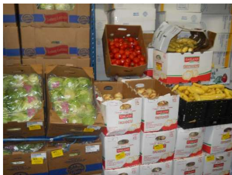
Tarrant County American Rescue Plan Act was a game changing grant to provide our client with fresh produce.