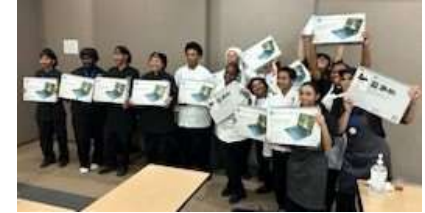
Each FW Iron Chef participant receives a new laptop from Community Food Bank.