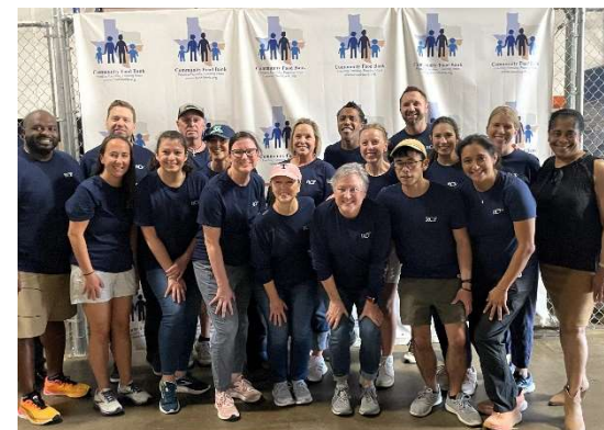
Rainwater Foundation Great volunteers