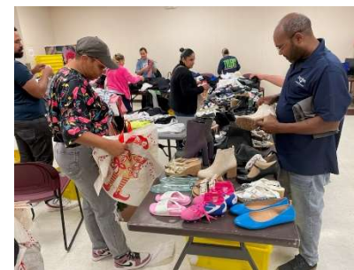
Lots more clothes given at the Doc Session Community Center!