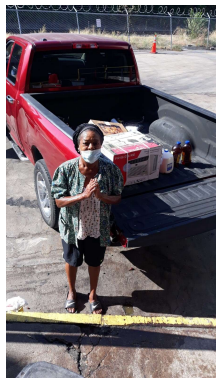
A very thankful client getting a new A/C unit loaded into her truck.