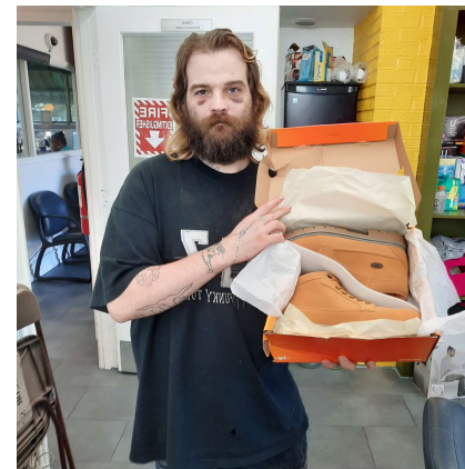
New boots for a new job.