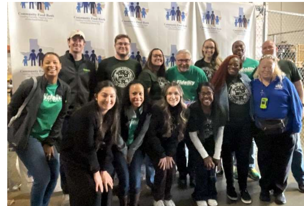
Fidelity volunteers posing for the afterwards group photo.

Our year ended with an exciting Christmas Giveaway, 25 new trees were distributed, first come, first served, over 1,000 kids registered and received 3 – 5 toys each, and 300 kids were given bicycles. Gina, our Community Relation Coordinator made sure gift wrap, bows, and lights were available for clients.